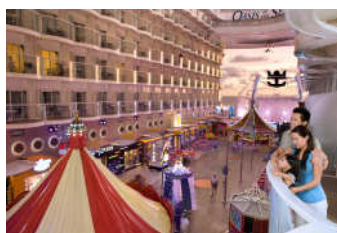
木板走道景觀露台房 Broadwalk with Balcony