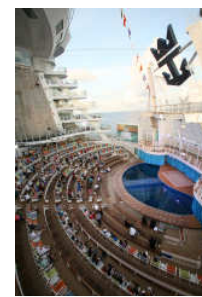
水上劇院 Aqua Theatre