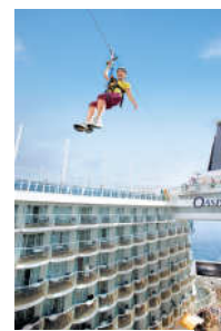
空中繩索 Zip Line